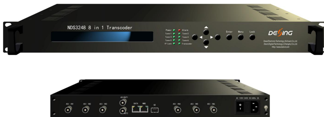
ASI Input Version